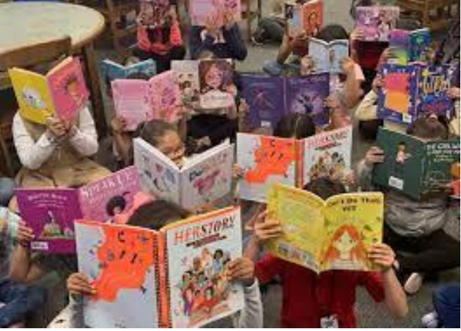
Soroptimist International Palm Desert empowers girls through education and reading