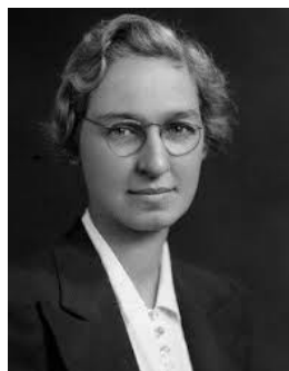
Dr. Virginia Apgar