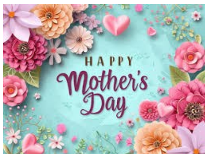
May 10-Mother's Day