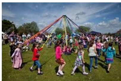
May Day-May 1