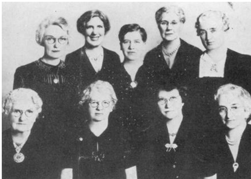
The Charter Members of the First Soroptimist Club in 1921

The name Soroptimist was coined from the Latin soror meaning sister, and optima meaning best. And so Soroptimist is perhaps best interpreted as 'the best for women'.